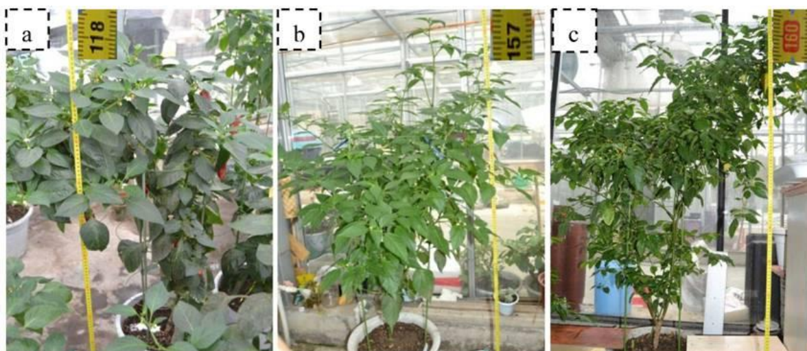
Figure 1. Whole plant height and attitude of cultivated pepper, wild relative and interspecific hybrid F 1 . (a) Cultivated pepper ( Capsium annuum ) 007EA, (b) Interspecific hybrid F 1 ( C. annuum × C. frutescens ) and (c) Wild relative ( C. frutescens ) P1512.

morphological characteristics, interspecific hybrid was closer to the wild species compared to the cultivated species. These traits included plant height, the internode length, leaf length, leaf width, leaf petiole length, petal number, corolla diameter, stamens length, fruit weight, fruit length, and fruit diameter (Supplemental Table 2; Figure 1). These traits had smaller values in wild species and interspecific hybrid, with the exception of two traits (plant height, the internode length) that had higher average values (Supplemental Table 2; Figure 1). Furthermore, we also found that interspecific hybrids were extremely similar to the wild species in the following four traits including flower color, pedicel position, leaf and fruit shape. On the contrary, interspecific hybrids were found closer to cultivated species in the fruit position. Moreover, purple anthocyanin accumulated at the nodal positions in the cultivated species and interspecific hybrids, except for the wild species (Supplemental Table 1). In addition, while the interspecific hybrids had an intermediate value in flower size, the traits related to the pedicel and style length had much higher values in the interspecific hybrids compared to the parental lines (Supplemental Table 2; Figure 2). Regarding seeds, there were many seeds with the embryo abortion in